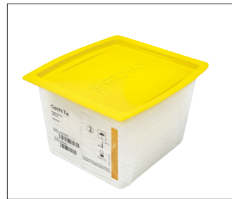
FlexiBulk ® Pack