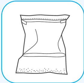
Enrichment or rinse sample