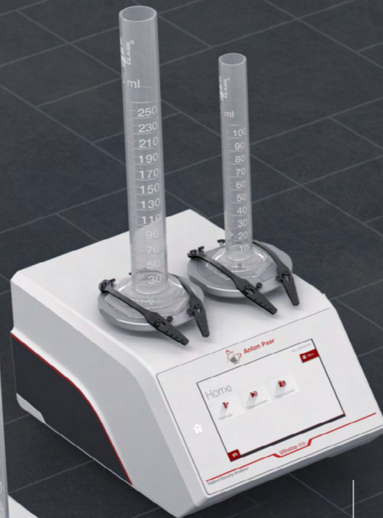
Standard platform 100 mL and 250 mL graduated cylinder