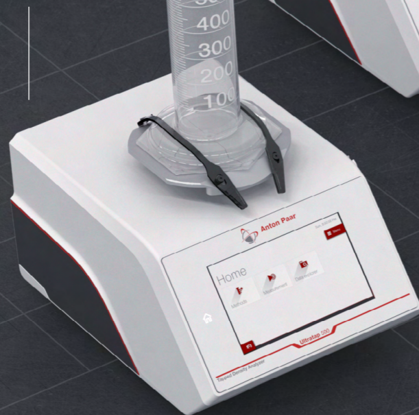
Large platform 1,000 mL graduated cylinder