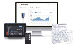
DIGITAL LAB SERVICES