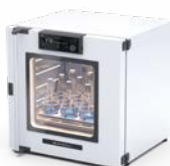
HEATING / COOLING / TEMPERING