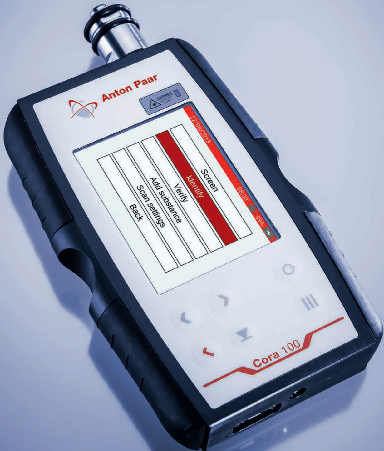
Handheld Raman Spectrometer