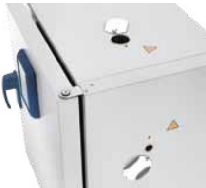
Additional access ports top and right