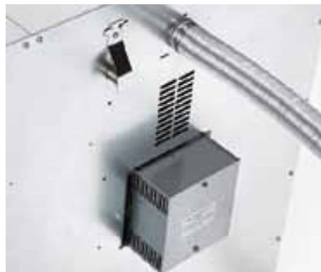
Underbench installation kit

Custom solutions available for table top ovens cable testing applications, clean room applications, and inner casing with conditional gas-tightness for inert gas applications. Access ports can be provided for large capacity ovens at preferred positions