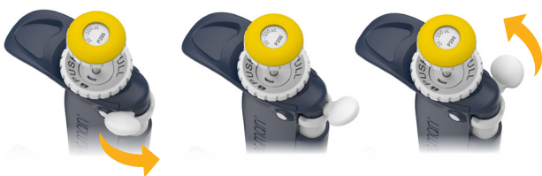
Adjustable Tip Ejector

Four PIPETMAN L multichannel models (product description ending with VR), covering a volume range from 20 \mu\text{L} to 300 \mu\text{L} , are equipped with V-rings at the bottom of the tip holders for a proper fit with most tip brands.