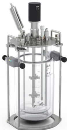
For example HABITAT ferment dw 5 for 5 liters

Now you can complete your control unit package with the matching vessels: In addition to the control unit package, you order the matching vessel package according to your application and your working volume. And you're ready to go.