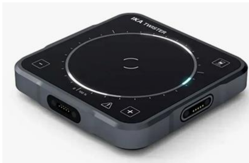
Figure 1. The IKA Twister

Wet labs employ a variety of equipment types for preparing and agitating materials. Vortex mixers, magnetic stirrers, and orbital shakers are routinely used. IKA have recently released the IKA Twister (Figure 1), a product which can perform the functions of all three of these equipment types. Products such as the IKA Twister represent a response by industry to reduce the environmental impact of scientific research. Products which use less raw materials and reduce supply chain emissions are an essential component of the scientific sector becoming carbon neutral.