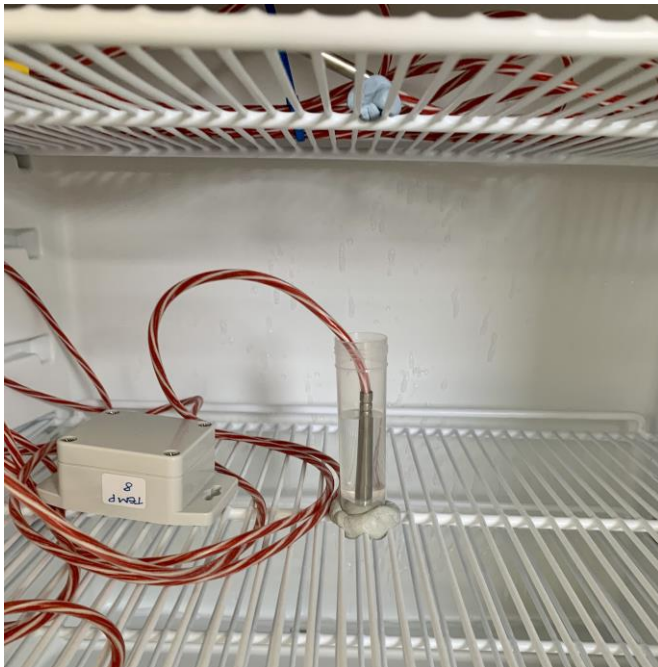
Figure 2. Sample probe was placed on the middle compartment of each unit. Central to the photo is the sample representative probe. Above this the probe in the top compartment can be seen.

Both the fridges and freezers were monitored using 3 temperature probes, each placed in the centre of their respective compartment. The middle compartment was monitored using a sample probe which was 10ml of glycerol (figure 2).