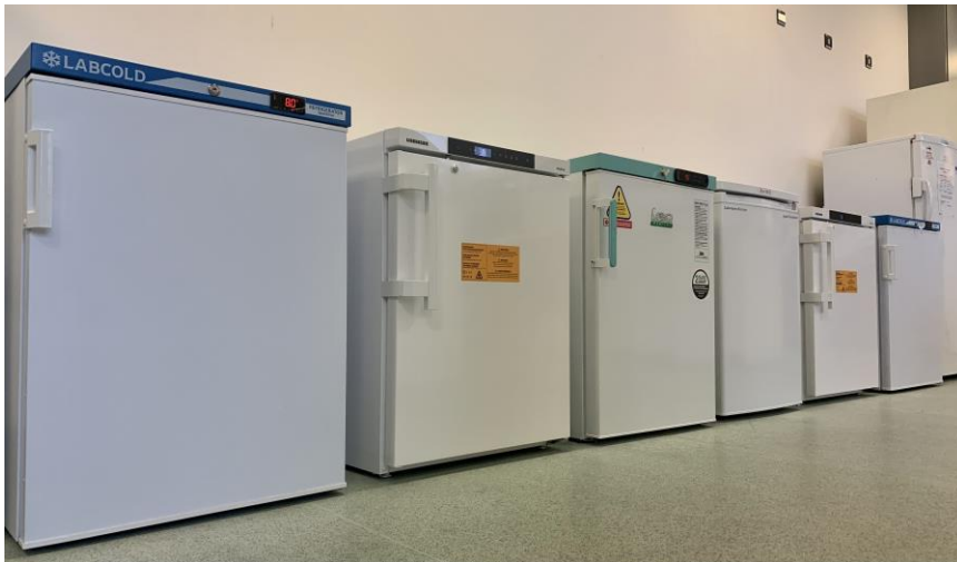
Figure 1. The three fridges and three freezers examined at the Learning and Research Centre, University of Bristol.

Fridges and freezers are widespread throughout scientific research and teaching. They are found in molecular sciences, life sciences, chemistry and stores departments throughout the UK. A range of models are available and lab operators may choose from a selection of units which will vary in their price & performance. With labs aiming to minimize their running costs, highlighting the models with the lowest running costs is a useful exercise. However, energy consumption values alone would not be serving end user requirements. This study aimed to highlight some of the data and criteria which should be considered when selecting the most sustainable solution based on the specific needs of the researcher, their laboratory and the materials they are storing.