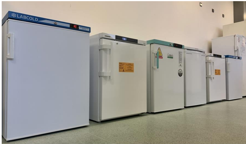
Figure 1. The three fridges and three freezers examined at the Learning and Research Centre, University of Bristol.

Fridges and freezers are widespread throughout scientific research and teaching. They are found in molecular sciences, life sciences, chemistry and stores departments throughout the UK. A range of models are available and lab operators may choose from a selection of units which will vary in their price & performance. With labs aiming to minimize their running costs, highlighting the models with the lowest running costs is a useful exercise. However, energy consumption values alone would not be serving end user requirements. This study aimed to highlight some of the data and criteria which should be considered when selecting the most sustainable solution based on the specific needs of the researcher, their laboratory and the materials they are storing.