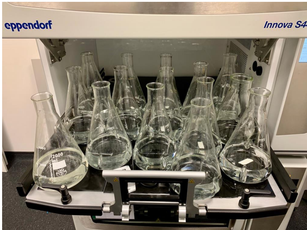
Figure 4. The Eppendorf S44i filled with 15 Erlenmeyer flasks.