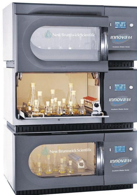
Figure 1. Three stacked shaking incubators.

Shaking incubators agitate culture media, ensuring aeration and an even distribution of nutrients. They are used to grow yeast, bacterial cultures and tissue cultures, shaking incubators are found a wide range of research laboratories. Units are in regular use and may be shared by a number of researchers with many samples required to be heated and agitated for 24 hours. Ranging in size, units may be benchtop or large, stackable floor standing models (figure 1).