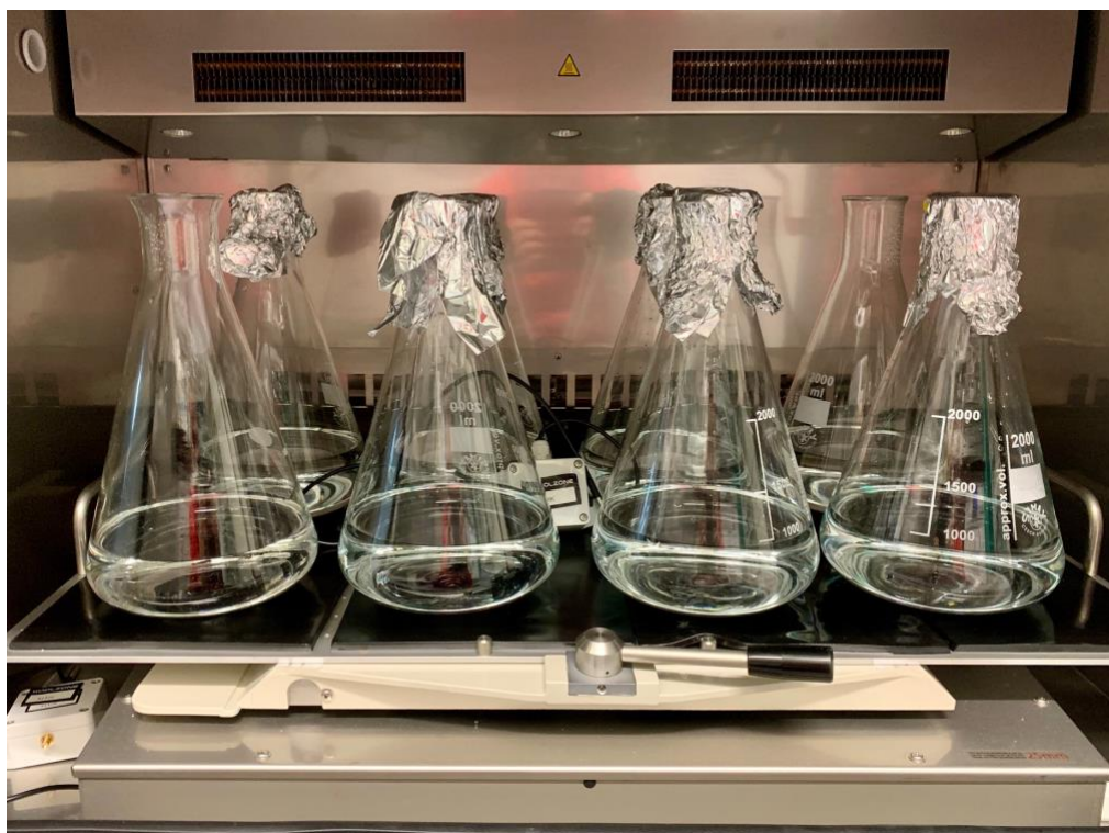
Figure 3. The Kuhner unit filled with 8 Erlenmeyer flasks.