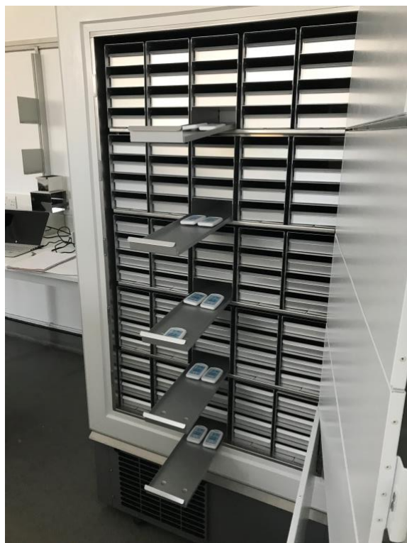
Figure 1. ULT freezer fully racked with temperature loggers in place. Testing The Impact Of Racking

Ultra Low Temperature (ULT) freezers are a predominantly used in life sciences for the long term storage of valuable samples and products. The use of racking can vary with some ULT freezers being completely racked (figure 1) whilst others are devoid of any racking whatsoever. Racking can be made of aluminium or stainless steel. This study set out to identify what impact of aluminium racking upon the temperature and energy performance of a ULT freezer at the -80°C set point.